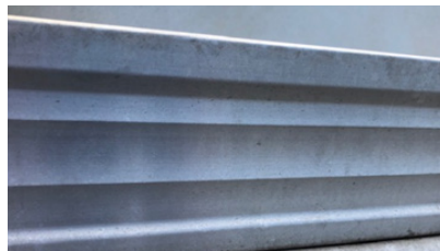
Figure 2: 6005CL alloy – After 6 years