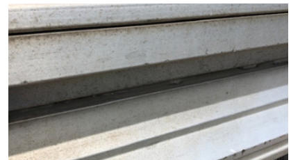
Figure 3: 6005CL alloy – After 21 years

The above examples were exposed to C4 category corrosion levels and were in contact with highly contaminated products. In addition, there were no surface treatment or regular cleaning through its lifespan.