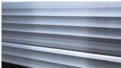
Figure 1: 6005CL alloy – After 1 day

R-ECO/4XXX/AUMF is a non-anodized product. We warrant this product, and 'The Cutter Rail' will maintain its structural integrity throughout its design life when installed, in accordance with the Clenergy Installation guide.